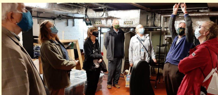
Under the stage at the Joseph Rowntree Theatre tour

Thanks as always to our main sponsors, Harrowell's Solicitors, Foresters Friendly Society (since 2009!) and Later Life Hub an organisation promoting independence in later life.