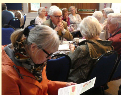
Cuppa, cake & chatter at St Nicholas Church, Dunnington