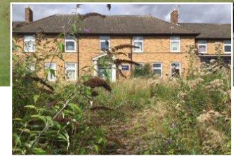
Bootham (top photo) Oakhaven (below)

The MP for York Central – Rachael Maskell has echoed our concerns about the cost of the former hospital at Bootham remaining empty for over 8 years. The cost now stands at over £2.6 million. The previous plans, supported by the Assembly, for an Extra Care Scheme have fallen through because of rising costs.