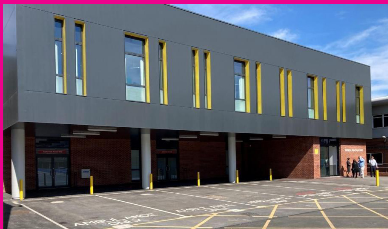
York Hospital's new A&E Department

Admissions to York hospital for those over 65 for injuries resulting from falls has risen over the previous year to 27.4 per 1000 emergency admissions. This varied across the City from 13.7 per 1000 in Heworth Without to 42.7 per 1000 in Fulford and Heslington.