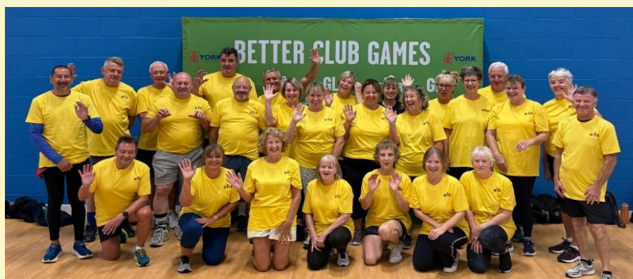
Senior Club 60+ session, York Leisure Centre

The finale followed Saturday's special celebration, where crowds of residents and visitors gathered to enjoy the joyful 50+ Grand Parade and a host of musical delights in the heart of our city.